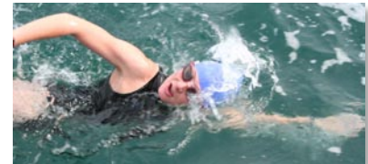
2009 Adult Channel Relay

The Junior Sports Programme will be contributing towards the cost of the event and, if successful, the participants will receive the newly-announced Junior Sports Programme Gold Award.