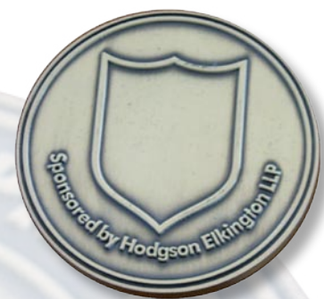
Reverse of Medal (Can be engraved onto by the awarding club)

The Junior Sports Programme 'GOLD AWARD' is a small but significant recognition of their efforts.